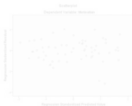
Figure 2. Result of Multicollinearity Test

esting using SPSS obtained the following results: