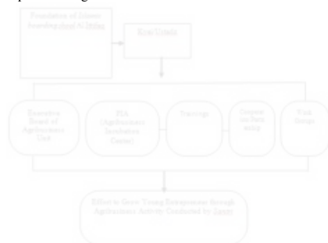
Fig.1. Effort to Grow Young Entrepreneur at islamic boarding school of Al Ittifaq Ciwidey Bandung Through Agribusiness Activity for the Purpose of Santri Empowerment

Description of the effort to grow young entrepreneur at islamic boarding school of al Ittifaq Ciwidey Bandung through agribusiness activity regarding santri empowerment is presented figure1.