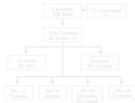
Fig. 2. Organizational Chart of Executive Board of Agribusiness Unit at Islamic boarding school of Al Ittifaq